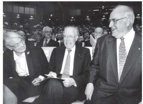
With her second husband, the nuclear physicist Heinz Maier -Leibnitz and German Federal Chancellor Helmut Kohl

Her entire life story is marked by countless incidents demonstrating this unbridled energy. As a ten-year-old, she announced to her parents that she was going to be a journalist—and she became a journalist. As a twenty-year-old university freshman, she decided on practically the first day at the university that she was going to spend a year abroad. At the office responsible for organizing student exchanges, the amused officials informed her that there were a total of six openings for thousands of applicants. She did not let that bother her. Subsequently, she did in fact receive a scholarship for a year abroad at the School of Journalism in Columbia, Missouri, where she first encountered the Gallup method and thus the main focus of her life. After returning to Germany, she brusquely informed her professor, Emil Dovifat, the renowned newspaper researcher who was supervising her dissertation in Berlin, that she was ditching the topic he had suggested for her dissertation and was instead going to write about the fascinating new method of mass surveys being employed in the United